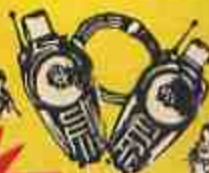
ELECTRONIC TWO-WAY WALKIE-TALKIE